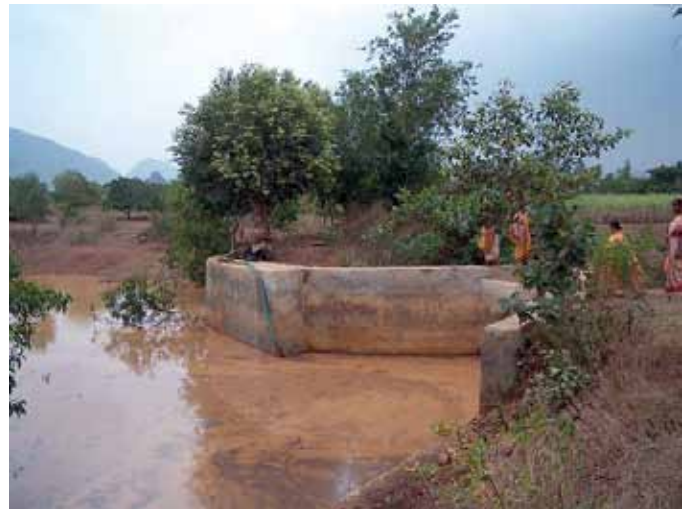
Small dams like this one have made the difference for small farmers

For several years CCDO, our project partner in rural Andhra Pradesh, India, has been training farmers in wasteland reclamation and watershed management using simple gully bunding, checkdams and storage reservoirs. The techniques allow the farmers to make use of rains that fall in the mountains a distance away rather than letting the water rush away causing erosion. With these simple means of water storage and irrigation, the farmers have been able to plan their crops and reap better, more reliable harvests. Never was this more important than in the past year when the monsoons failed. Even without the usual amount of rainfall, the farmers did have a harvest. Unfortunately, this was not the case in neighbouring communities that had not been part of the project.