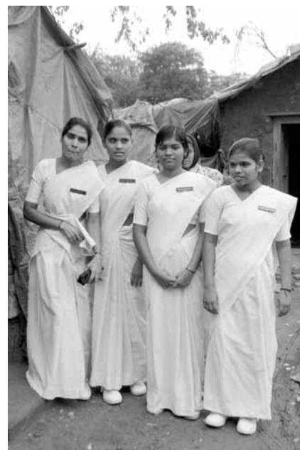
Young women from multi-purpose healthworker program learn as they work in slums

incomes through training for better paying jobs and access to micro-credit which saves the people from usurious debt charges levied by moneylenders. Where a nobody could be considered above the poverty line at the beginning of the project, now almost 20% can make that claim.