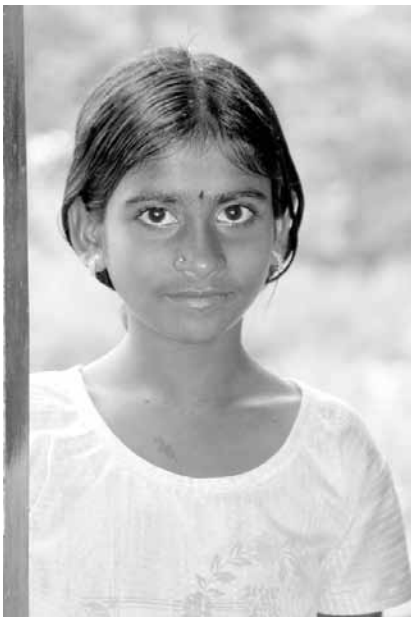
Changing the lives of girls and women