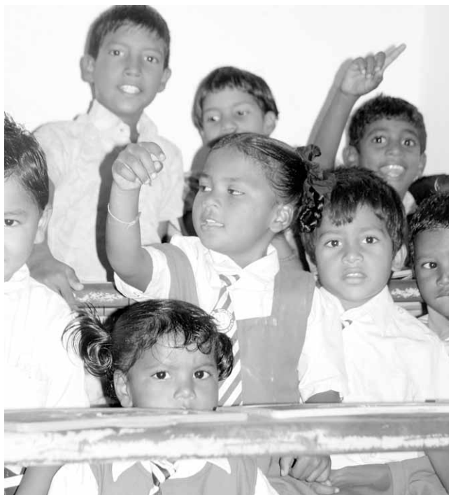
Children at HOPE School