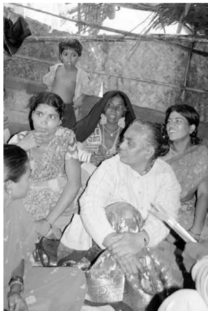
Women's self help group

Through leadership training and exposure to other communities where change has already occurred, the people have come to believe that it is possible for them to change their lives for the better, and that they can develop the skills to do so. This is the beginning of daring to hope.