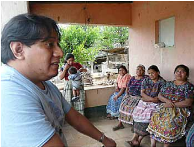
Similox with women's micro-credit group focussed on weaving and sewing.

Guatemala is a land of paradoxes: exquisite natural beauty and proud cultural identity contrasted with serious social challenges. Widespread poverty and low education rates among the majority rural indigenous Mayan population are serious problems.