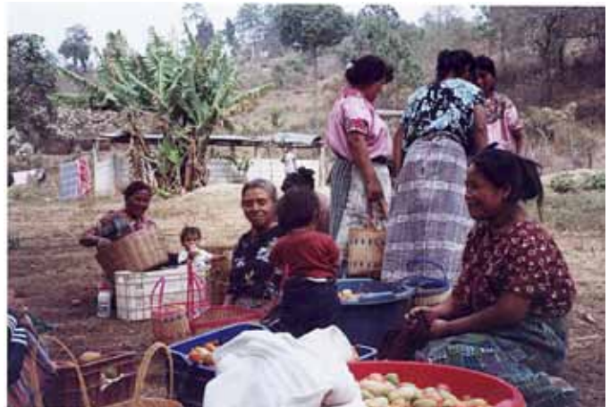
Vegetable raising is another small enterprise.