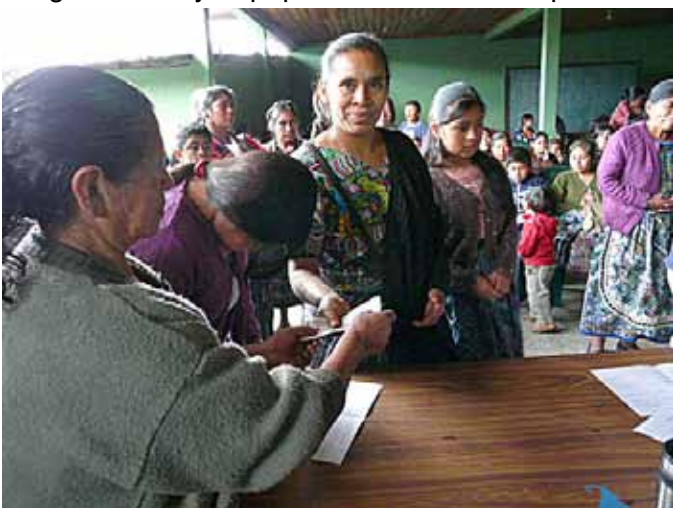
Women meet together to discuss their projects.

Guatemala is a land of paradoxes: exquisite natural beauty and proud cultural identity contrasted with serious social challenges. Widespread poverty and low education rates among the majority rural indigenous Mayan population are serious problems.